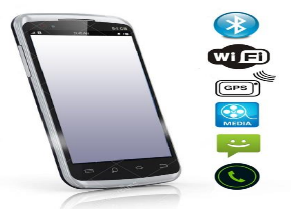
Fig. 1. Features of Smartphone.

requires interaction strength that can reduce the number of test cases based on the identified requirements or based on tester experience.