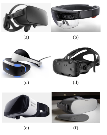
Fig. 2: Interaction Dispositive Prototypes.