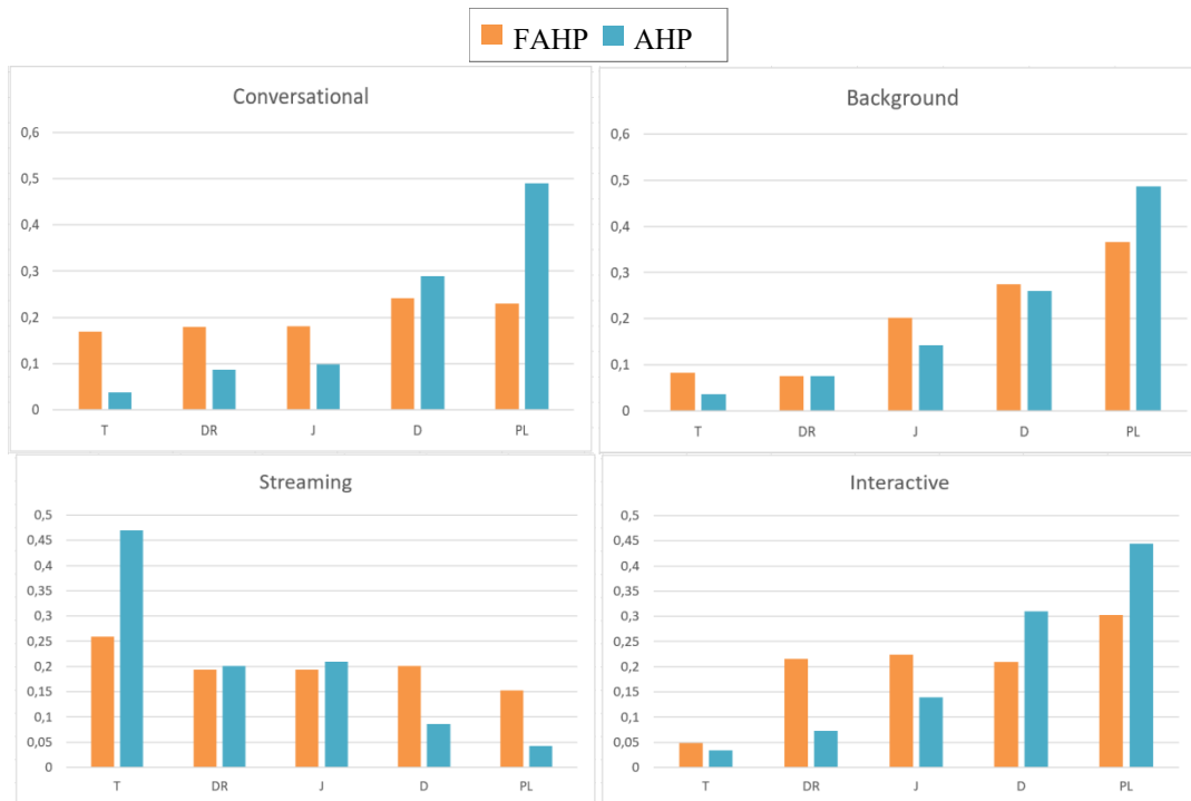
Fig. 2. Associated Weight for Each Class of Traffic.

The average number of handovers is exposed in “Fig. 3” that clarifies the performances of E-MGRA for each class of traffic. We notice that our E-MGRA method overcome the traditional MGRA by reducing the number of handovers with a value of 2% for conversational, background, and streaming class. Although, interactive traffic dropped by up to 3% compared to the traditional MGRA algorithm. E-MGRA approach assert that this evolution produces the best selection of network. Finally, we achieve that our proposed approach can effectively solve handover problems in a heterogeneous network.