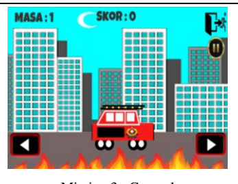
Mission 3: Play

The controller buttons were fixed with the design and position to ensure the consistency in every screens. The fire images were added too.