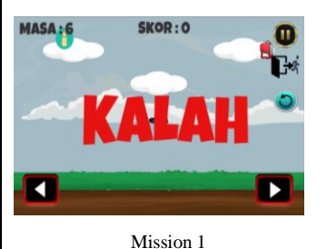
where if the player gets the wrong items, the screen will show KALAH (You Lost). Along with the time was fixed too using C#.

The controller button changed in terms of design and position. For the design, the controller buttons were fixed to ensure the consistency in every missions. Meanwhile, there were differences between the position of controller buttons and Next, Previous buttons to avoid confusion for the users.