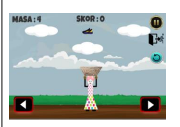
Mission 1 : Gameplay

The controller button changed in terms of design and position. For the design, the controller buttons were fixed to ensure the consistency in every missions. Meanwhile, there were differences between the position of controller buttons and Next, Previous buttons to avoid confusion for the users.