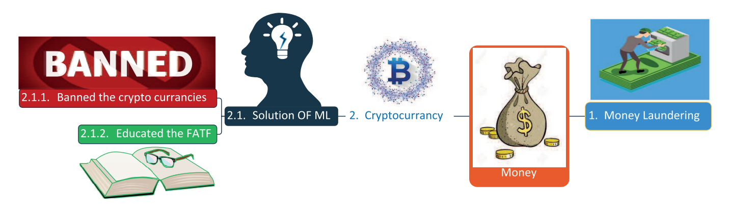
Fig. 3. (Money laundering solution structure using blockchain)

Government (DSG). Dubai government had set up a Dubai Vision in 2013 and build a committee which was consist of many departments involved in the vision of Smart Dubai. An executive committee for Dubai Strategy was formed in 2014 consisting governments representatives and private investors.