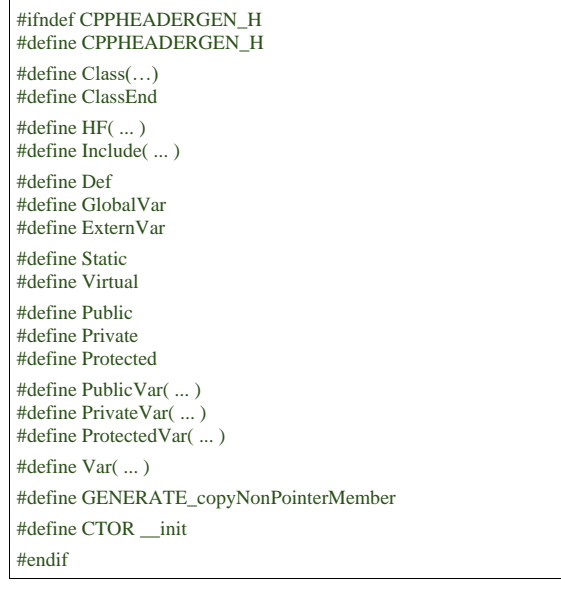
Fig. 8. Content of cppHeaderGen.h.

a) Generate methods inside a dedicated gen.cpp file (default): Generating methods inside a dedicated gen.cpp file is the default setting. It's necessary to add the generated file to the list of files to compile (e.g. the project). Fig. 9 shows an example input for generating a constructor for a class. Fig. 10 shows the generated output.