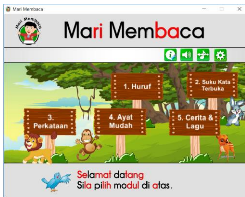
Fig. 2. Main Menu of M2M Game Application.

Fig. 4 shows a screenshot for the “Suku Kata Terbuka” menu. In this first activity “Tarik & Letak”, user needs to choose the correct syllable to form a word from options provided by drag on it and drop into box. Picture is provided to give an idea to user.