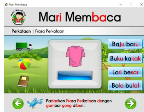
Fig. 5. Menu of “Frasa Perkataan”.

Heuristic evaluation of M2M application was conducted through offline activities where the apps were installed in the researcher laptop. The procedure of the evaluation consists of following steps as follows: