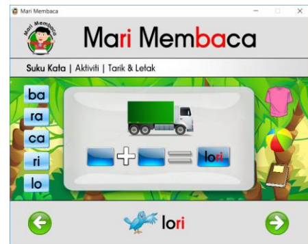
Fig. 4. Menu of “Suku Kata Terbuka”.

Fig. 5 shows a screenshot for the “Frasa Perkataan” menu. In this activity, user needs to choose the correct words based on the picture given. User must select the answer from options provided by drag on it and drop into box. Picture is provided to give an idea to user.