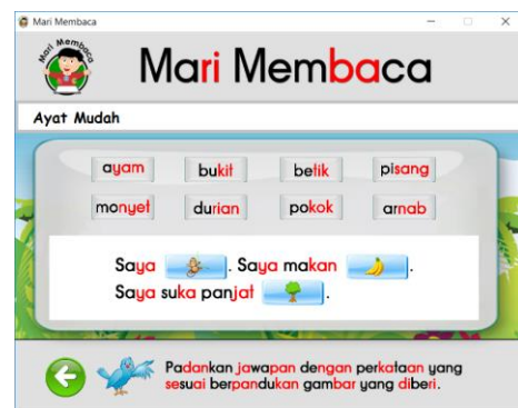
Fig. 6. Menu of “Ayat Mudah”.