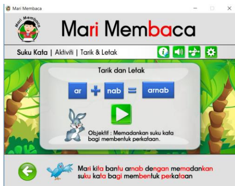
Fig. 3. The Objectives will be Preview on the Front of the Module.