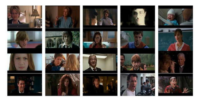
Fig. 1. Facial Emotions. different Human Emotion are Depicted from their Faces in the Provided Sample Images.