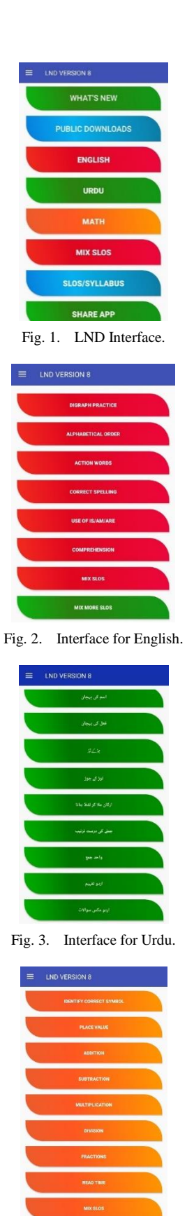
Fig. 4. Interface for Math.