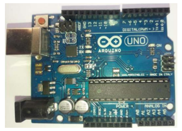
Fig. 5. Arduino used for Decision.

6) Cloud stage: Here we utilize "ThingSpeak" cloud stage to send the detected information to the cloud. This information sent is plotted against the diagram to see the adjustment in the temperature, mugginess and the shading. Contingent upon the information that is plotted against the diagram we check whether the qualities fall into a similar range. On the off chance that they do as such, at that point the leaf is sound or else it is sick