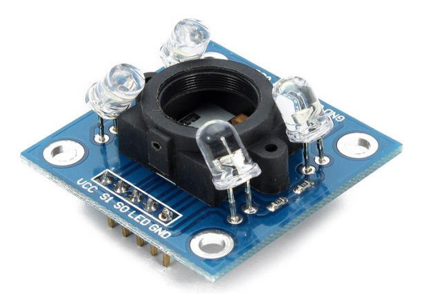
Fig. 4. Tcs3200 for get Color from Leaf.

Fig. 3. DHT11 for Humidity and Temperature.