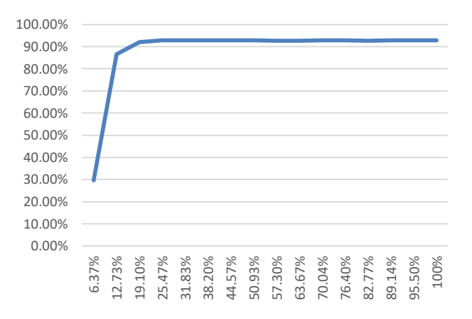
Fig. 2. G-Mean Evolution for KNN Algorithm through Iterations of SMOTE Percentage.