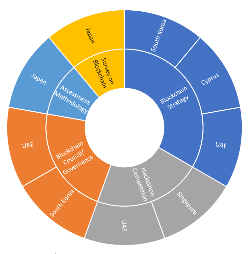
■ Blockchain Strategy ■ Blockchain Council/Governance ■ Hackathon Competition ■ Survey on Blockchain ■ Assessment Methodology