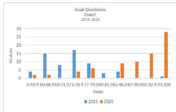
Fig. 3. Exam#3 Grade Distribution.

The student’s in the synchronous online class grades improved steadily after exam#1, obtaining average grades of 72% and 88% on exam#2 and exam#3 respectively. Exam#2 covered course objectives (2 and 3), and exam#3 covered course objectives (5 and 6). Since these exams covered fewer course objectives on each exam, this naturally reduces the complexity of these exams when compared to the exams taken by students in the traditional face-to-face class.