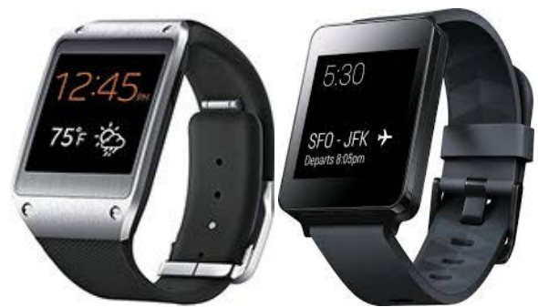
Fig. 1. Samsung Galaxy Gear & LG Smartwatch [17] [18].