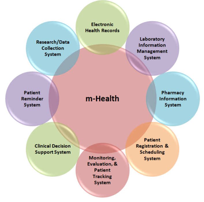
Fig. 1. Functional Parameters and Key Systems of m-Health Systems.

b) Laboratory Information Management System: This plays a key role to support the administrators, doctors, and healthcare personals with the information related to laboratory activities. The required patient information at the correct time helps to make appropriate decisions to avoid any kind of mistake by the hospital authorities.