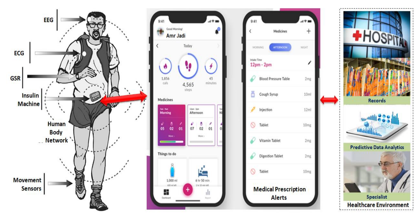
Fig. 2. Proposed Mobile Health System.

(IJACSA) International Journal of Advanced Computer Science and Applications, Vol. 11, No. 4, 2020