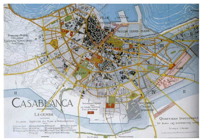
Fig. 2. The Henri Prost Development Project (1915) for Casablanca.