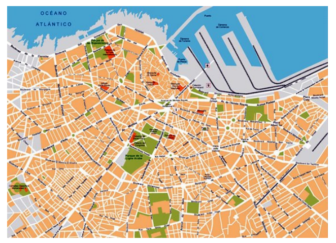
Fig. 4. Urban Expansion in Casablanca in the late 1990s.