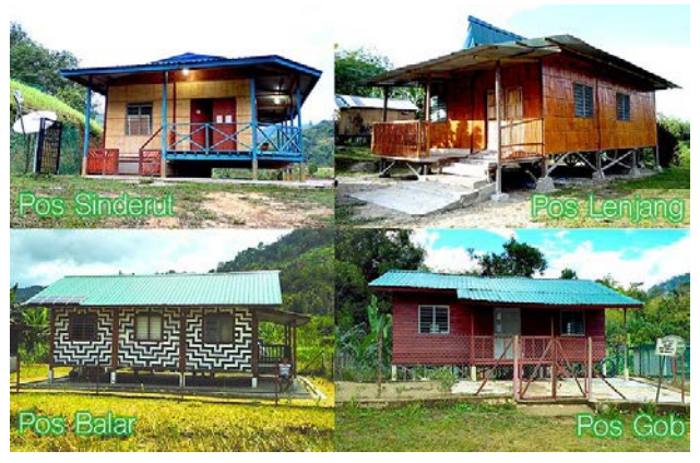
Fig. 3. The Four unique TPOA Telecentre Buildings.

responsibility to ensure the safety of the building and also taking more initiatives to maintain it within their capacity. In the remote rural environment with minimum access to external support, telecentre can only be sustained effectively by the commitment of the local community. Fig. 3 shows the unique design of the four TPOA telecentres of Orang Asli at Pos Sinderut, Pos Lenjang, Pos Balar, and Pos Gob respectively representing their unique community identities.