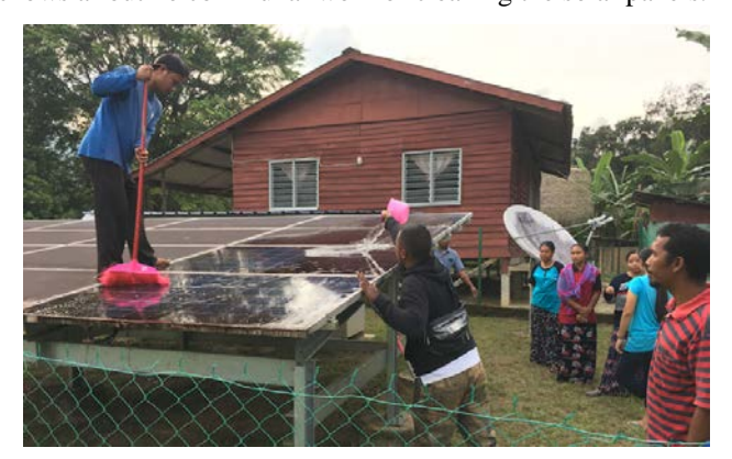
Fig. 4. Routine Communal Work of Cleaning the Solar Panels.

supply system will require periodic cleaning and this is the time the panels get clean up in order to maintain the performance of the solar power system always at its peak. Hence, the culture of communal work will certainly help in sustaining the telecentre services to its designed lifespan. Fig. 4 shows a routine communal work of cleaning the solar panels.