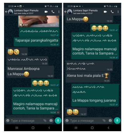
Fig. 3. Lontara Yusring on Whatsapp.

lontara application must be used on the keyboard of a laptop or personal computer (input) and not on a smartphone. However, Whatsapp or Telegram, where the lontara application is used, can still be seen (output). For example, the lontara application, which is inputted on Whatsapp and Telegram laptop but seen on mobile, can be seen in the following Fig. 3: