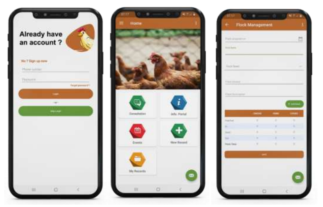
Fig. 2. Poultry Farmer's Mobile Application.