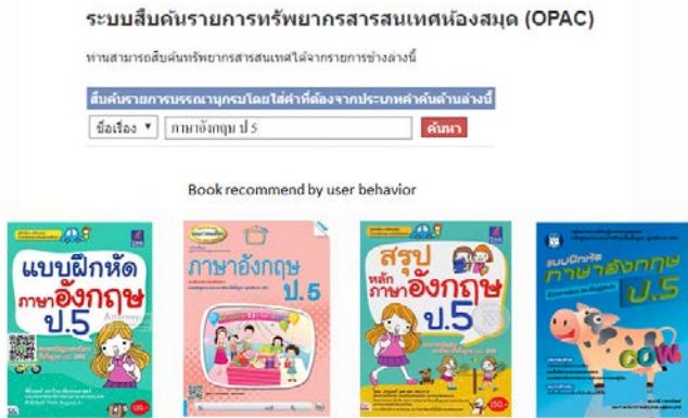
Fig. 4. Example of OPAC Implement with Book Recommendation.

in grade 5”, the algorithms arrange the top four highest scores to show from highest to lower respectively the program shown in Fig. 4.