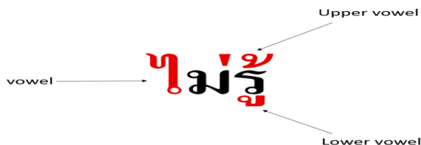
Fig. 3. Thai Word Combination of Upper Vowel and Lower Vowel.

Based on characters to represent in Thai language, we observed and enquired the librarian about the problem of information searching of automation library in the school of Banpasao Chiang Mai. We found the two main problems of book searching related to upper/lower vowels. First, the user always misinformation to spell the upper or lower vowel in the keyword search for example, อยากให่เรื่องนี้ไม่มีโซคร้าย (correct spell) vs อยากไห่เรื่องนี้ไม่มีโซคร้าย (miscorrect 3 upper voxel). In this case, the most similarity measures for title compute upper voxel as the main character to compute distance [17] which may not be accurate because the user is not aware the upper voxel is not important in Thai language and affects the meaning of the word in terms of computation. Second, the librarian cataloged the spell of wrong pronunciation in the title such as misspell upper and lower vowels, misspelling of transposition of word. In this case, we found misspell the word of title 43 from 2251 book title from the database record in school of Banpasao Chiang Mai. Thus, the title can always misspell pronunciation or user error input as follows.