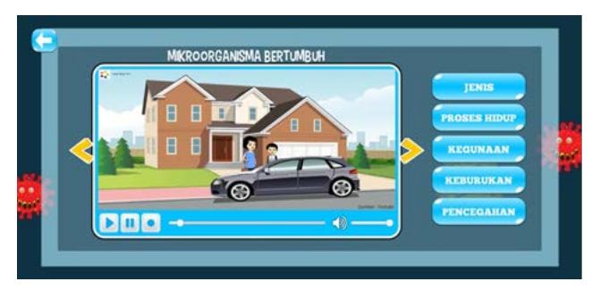
Fig. 5. Video Page.