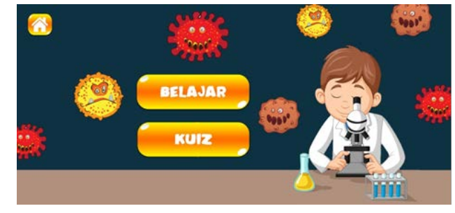
Fig. 3. Category Page.

The application can access the users' camera to allow users to scan the designed marker. Fig. 6 shows the page that displays the 3D model where users can select the Fungi, Bacteria, Viruses, Protozoa and Algae buttons to view 3D models related to the chosen type of microorganism. There is also a back button to return to the Notes page.