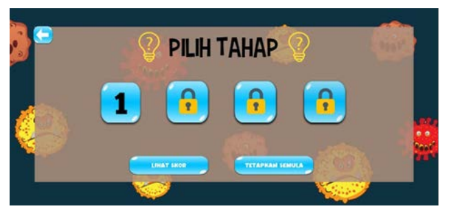
Fig. 7. Level of Difficulties in the Game.

Fig. 7 shows the game level where users have to answer the quiz questions in order to move to a higher rank.