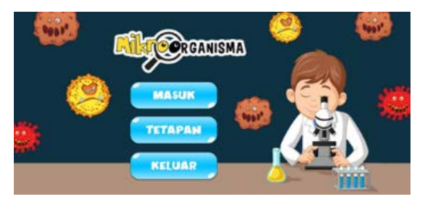
Fig. 2. Main Page.

Fig. 3 shows the category page where users can select the Belajar (Note) button to view notes related to Microorganisms or the Kuiz (Quiz) button to answer quizzes. Users are also allowed to return to the main page by clicking the home button at the top of the page.