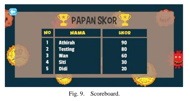
Fig. 9 shows the scoreboard page to displays the five highest user scores in ascending order.