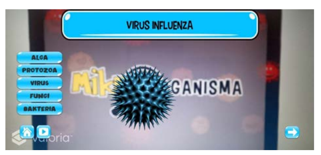
Fig. 6. 3D Model in Augmented Reality.

Fig. 7 shows the game level where users have to answer the quiz questions in order to move to a higher rank.