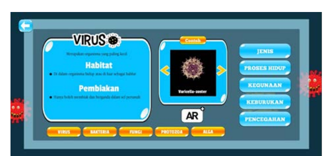
Fig. 4. Notes Page.