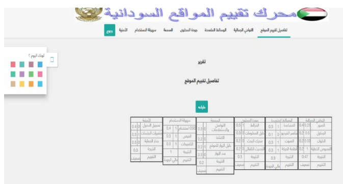
Fig. 2. Implementation of the Evaluation Details Screen.

Following are the various outputs of evaluation reports done in different types of Sudanese educational websites. Implementation of the evaluation details screen is shown in Fig. 2 which is one of the implementation result of the proposed system.