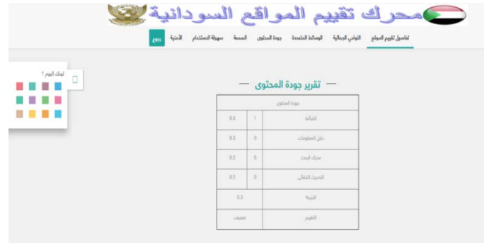
Fig. 3. Implementation Screen of the Content Quality Details.

The above figure depicts the implemented image of the evaluation details screen with all the details of the evaluation of the website, details of all standards such as aesthetics and multimedia, quality of content, reputation, ease of use and security etc.