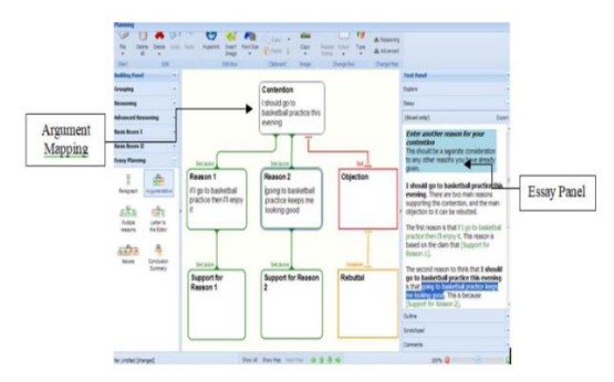
Fig. 2. Example of a Student's Argument Map (AM) Produced in CAAM.