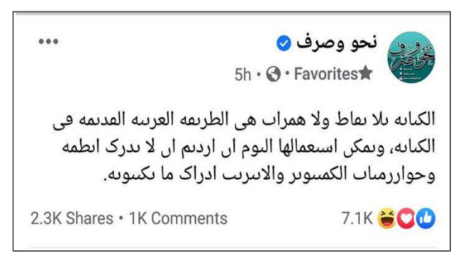
Fig. 5. An Example of the use of Arabic without Dots on Facebook.

Among users, to help with this form of writing, different algorithms have been developed to help convert written forms and differentiate them (without using dots) so that their posts are not deleted by Facebook. This has also been used as a way of enabling users to keep their accounts active, rather than being blocked or deleted by Facebook. It was clear that the artificial intelligence algorithms developed by Facebook were not effective in dealing with these non-standard linguistic features of Arabic, which can still be understood by many users even without the dotting system.