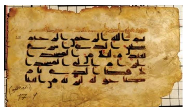
Fig. 3. An Example of Quranic Text.

Historically, with the expansion of the Arab and Muslim empire and the use of Arabic as a global language, it was difficult for many speakers of other languages to distinguish consonants. Thus, the dotting system was introduced in the 12<sup>th</sup> century [37, 38]. From that time on, Arabic has typically used dots for differentiation. Today, both standard Arabic and colloquial dialects are written using the standard dotting system, as shown in Fig. 4.