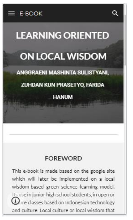
Fig. 4. E-book Display in a Smartphone.

Even by using the Google websites that we have designed, they can be accessed in the form of a smartphone display as shown in Fig. 4. The goal is to facilitate access so that students can use it anywhere and anytime.