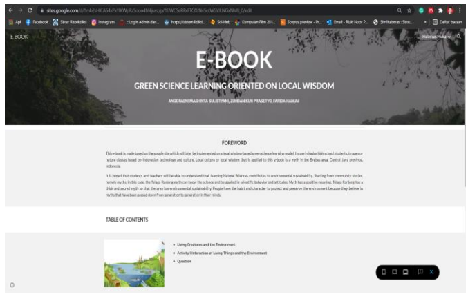
Fig. 3. Product Draft Start Page View.

The next stage is product development, namely from product drafts according to Fig. 3. The use of google sites is easy to use in the process of making e-books, without using complicated web coding, you can create good website features.