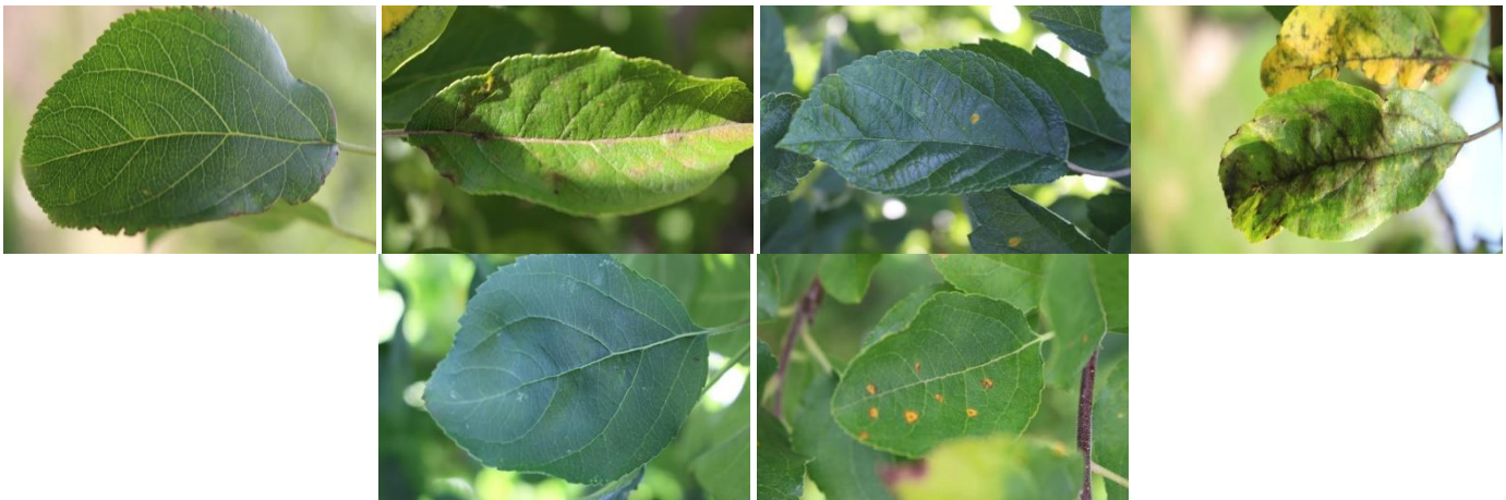
Fig. 2. Sample images in the dataset.

4) Images segmentation : Segmentation was done based on the area by extracting the contaminated area using the k-means technique. Image clustering commands were applied to only *a and *b components using the k-means method, and the images were divided into healthy and infected leaf areas. After this stage, because the disease spot had a smaller surface than the leaf surface, this area was selected. The remaining image processing and feature extraction operations were used on the picture of the diseased spot.