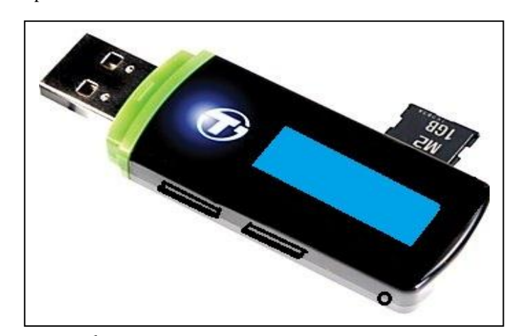
FIGURE 6. MODERN AND DIGITALIZED USB DEVICE WITH EXTENDABLE MEMORY CAPACITY

The hardware space required for the implementation of this idea of creating the memory slots in the body of the pen drive does not occupy much space. The size of the memory card is very less. The following figure shows the structure of the memory card slots in the body of the pen drive. The inclusion of this particular feature in the pen drive makes the computerized pen drive a complete advanced model hence giving raise a new gadget for storage and for data transmission purpose. The major factor which has to be kept under consideration is the size of the pen drive device because the main advantage of these USB pen drives is that they are basically very handy and compact by implementing this feature we must not spoil the nature of the pen drives look and smart sizes. The one more important thing is the cost for implementing this features on a pen drive device must be low as possible.