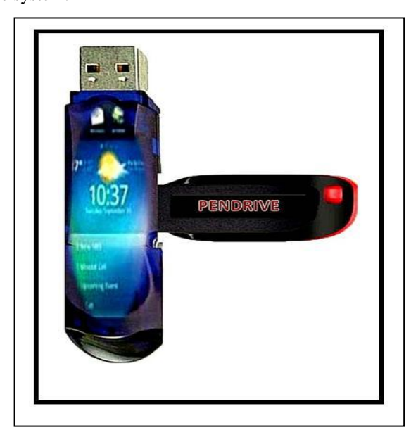
Figure 3.Data Transmission

The Data transmission is also the advanced feature in the computerized pen drive. Using this feature we can transmit the data to any other USB devices and the transmission from any other USB devices can be made very easy and simple using this computerized pen drive. The working of the computerized pen drive is similar to the computer system. The data transmission through this computerized pen drive will reduce the consumption of power. The need to connect portable electronic devices to each other has accelerated the adoption of USB onthe-go as an industry standard wired interface [4] for interfacing the two devices concepts. The data transmission in the Computerized Pen Drive can also be done without the use of the system.