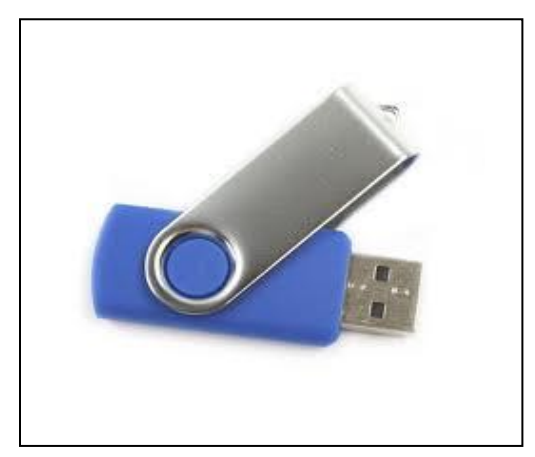
Figure 1. Look of a Normal Pen Drive.

The look of the normal pen drives which are being present now has no special features are as shown as follows in the figure 1. There is no display unit or in-built USB port for data transmission. It cannot operate without a computer system; completely depend on the computers for working with it.