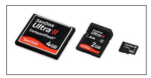
Figure 5.Types of memory cards

A memory card can also be called as a flash card and it is basically a type of electronic storage device based on flash memory concept for storing digital information like films, song and photos. The Memory can be used in many electronic devices like mobile phones, digital cameras and in MP3 players. It can also be used in laptop and desktop computers. The memory cards are basically small in size and rewritable storage device. The data which are stored in it will be retained even without power.