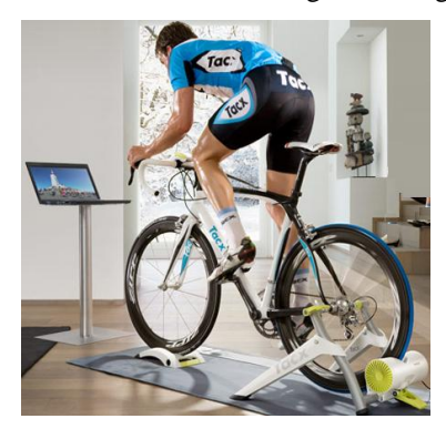
Fig. 3. Tacx Virtual Reality Cycling

Finally, the closest to our proposal is Gamerunner [28]. It was an attempt to exhaust the player using a treadmill as a controller which was made available in February 2011. It was yet another way to blend exercise and gaming. As seen in the Figure 4, it was mounted by a joystick to control moving directions and other gamming tools. The Gamerunner is a person-powered treadmill that features 17 buttons and a handlebar that can be turned for looking or moving.