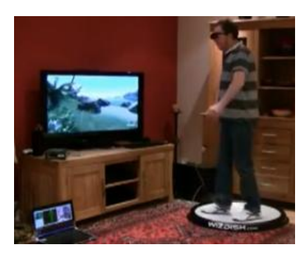
Fig. 2. WIZDISH

Although, all these controller or approaches may come close to satisfy our objective, which is to reduce games addiction, but not exactly. Players would stop playing their session once they get bored and not once they get tired. Thus, this may prevent them from using these controllers again. Our