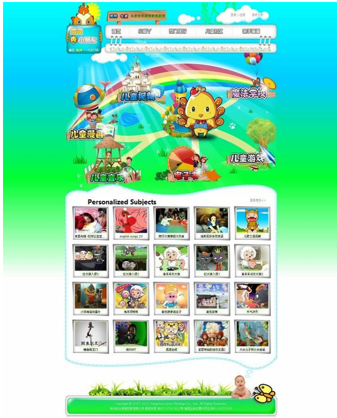
Fig. 4. Personalized multimodal subjects are shown for the students and teachers in the implemented PSL system (smart education module of Smart City project)

and the way it works during leisure hours as from the formal lessons in the classroom.