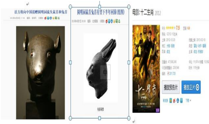
Fig. 3. CCA Correlates Antiques Returned to Old Summer Palace and Films by Jackie Chan

by inter-media correlation measure and relevance feedback within the detected topics. Two methods work together to complement to each other for comprehensive, personalized and subject based interactions. Students and teachers then have the easy access to the vast amounts of personalized education contents anytime.