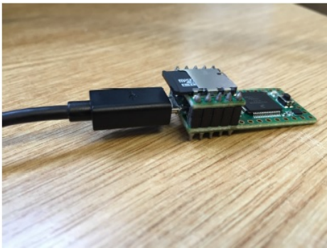
Fig. 1: Teensy HID

In this article we investigate the vulnerabilities of a SCADA system and perform an attack directed to an ABB PM564 PLC, using a HID . The Teensy device used is an Arduino based one that allows the user to utilize onboard memory storage on a microcontroller and to emulate a keyboard/mouse. By using this HID device (see Figure 1) we can bypass any autorun protections on the system since it is shown as a keyboard that is connected to the workstation. By sniffing the packets that are exchanged between the HMI and the PLC we manage to extract the information of a STOP command, replicate it and store it in a web host. As the PLC has been set to run, we insert the Teensy HID device into the engineer's machine, or a machine connected to the same subnet. Once the Teensy USB has been plugged into the system, it waits for a specific amount of time in order to download the code and execute it. The attack, although primitive, cannot be detected by any current IDS as it involves the execution of a legitimate 'STOP' order from an authorized device.