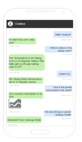
Fig. 2. A Sample User-Chatbot conversation

This ease of integration is a key motivation to develop platforms and frameworks which can synchronize chatbot applications within IoT platforms and frameworks.