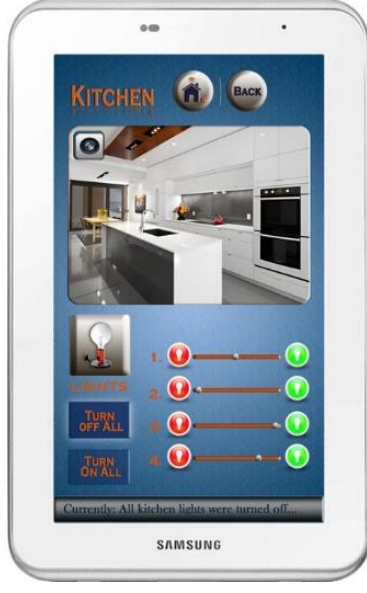
Fig. 1. "Back" button placed on the right of the page - weakness