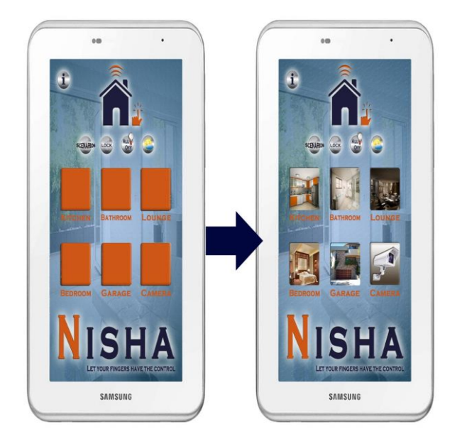
Fig. 2. Virtual images buttons instead of solid colour buttons