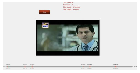
Fig. 6. Single Commercial Detection

Individual commercial detection steps can be performed by clicking on buttons "Detection Steps" or all steps can be performed by clicking on "Perform Complete Detection" that will perform detection and will show results single ad as shown in figure 6 and all ads shown in figure 7 respectively by indicating a timeline with commercial region highlighted.