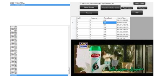
Fig. 4. Commercial Discovery Screen

Result can be viewed in a grid and any row can be selected to generate a training data for that row. Figure 4 shows screen Commercial discovery grid, from which any desired ad (scene) may be selected.