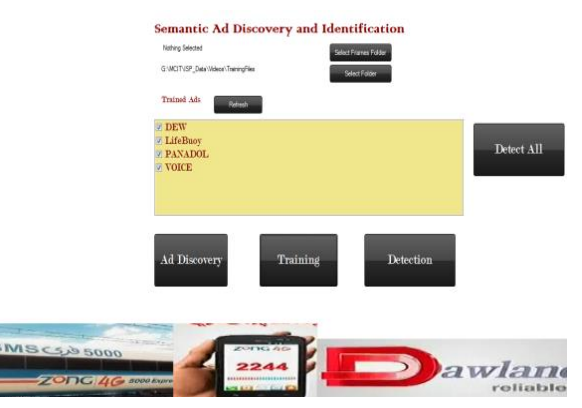
Fig. 3. Screenshot of main screen, showing options for selecting frames folder and training files for Ad detection

The screen shot of the designed application shown in figure 3. The details of each step are given below.