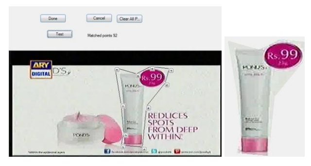
Fig. 5. Object Selector Screen, left side complete image right side selected cropped object of interest

Object selector screen allows user to select a key-object that is used for calculating reference SURF descriptor points. In figure 5, on the left side complete image is shown and on the right side selected object is showed. Clicking on "Test" button calculates surf descriptors for selected region and also calculates surf descriptor for complete image. Then these two are compared to get matching surf points. Number of matching surf points are shown to the user which can be used to decide if selected object is a good candidate for SURF matching or a different object may be chosen.