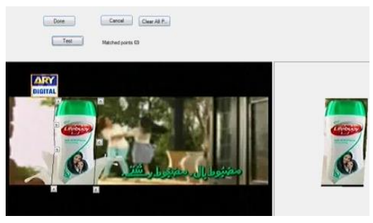
Fig. 2. Selection of object for SURF feature computation

In the Training phase first select frames from a specific commercial for which the system is required to train and RGB histogram is calculated. Using histogram variance information the commercial segment is split into scenes. If the histogram variance of two consecutive frames is greater than threshold the point is considered as a change point for scene. Then in second step user asks to select a key_object in the commercial segment which is significant with respect to the product of commercial. The key_object is used for computation of SURF (Speed Up Robust Transform) feature. Example of a selected key object is shown in figure 2. In this figure a bottle of Lifebuoy shampoo is selected as key_object from a video frame.