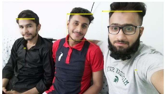
Fig. 5. Face detection.