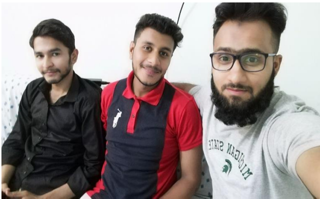
Fig. 8. Original image.