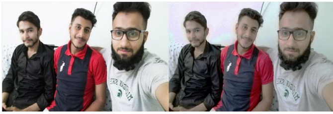
Fig. 6. Original image vs Equalized image.