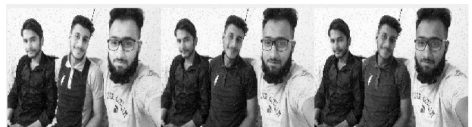
Fig. 4. Steps of noise removal.