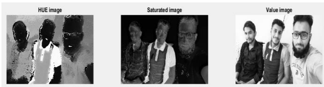
Fig. 9. Hue saturation value (HSV) of original image.