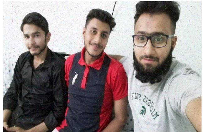
Fig. 2. Noisy image.

For simulation and results MATLAB R2017a is used. The simulation results are as following: