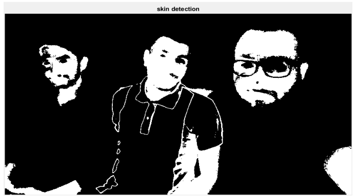
Fig. 11. Skin detection with NOGIE.