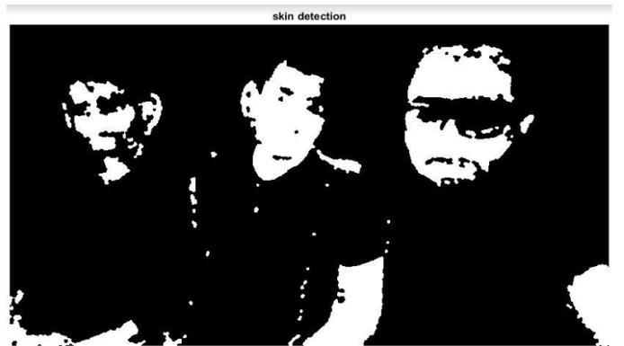
Fig. 12. Skin detection with NOWGIE.