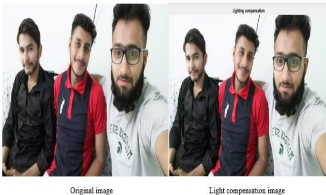
Fig. 10. Light compensation from original image.